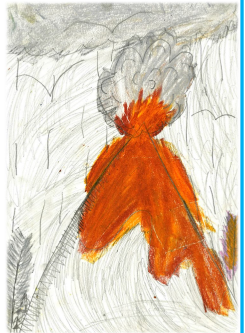
Bilal 4TW, Issam 4TW, Mekek 4TW

This week, Year 4 have been applying their knowledge of creating marks using oil pastels and graphite to create their own volcano inspired landscapes . The children have been able to choose one of their many ideas to create a final artwork. They discussed how they composed their pictures.